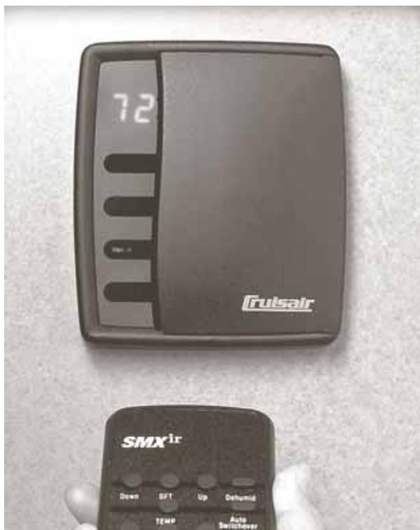
SMXir Keypad ( 3/4) door /Display with Remote Control

Cruisair offers two different SMX microprocessor control systems for use with tempered water (TW) air conditioning systems. SMX II offers the standard operational and safety features required for most systems. SMX Net adds networking capability and other special features that make it unique in the industry. The SMX II or SMX Net power/logic module is sold separately and wires to the air handler junction box with the supplied 3 ft. (.9m) wire harness. Either system can be retrofitted in the field to replace an electromechanical switch assembly. The SMXir keypad/display and optional SMXir remote is used on both SMX II and SMX Net systems.