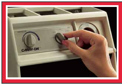
You can adjust the controls from inside the cabin.

The Carry-On runs on normal dockside 115V 60 Hz power. (The Carry-On 7020, a 220-240V 50 Hz model, is also available for applicable areas outside North America.) The Carry-On 7000 only draws 6.9 amps running. All internal components are made of corrosion-resistant materials, and the outside case is built of a tough, durable polymer. The best news is, the Carry-On is priced for budget-minded boatowners. It sells for a fraction of the cost of a built-in water cooled system.