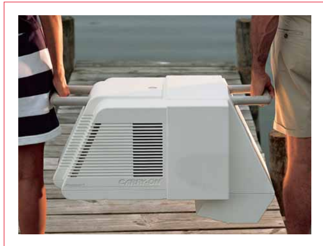
Carry-On is as portable as a cooler and can be stored in the trunk of your car.

The Carry-On is the only hatchtop air conditioning unit that is designed specifically for the marine environment. It's ideal for boats that are too small for installed seawater-cooled air conditioning systems. It installs in minutes. It won't break your bank account. And it pumps out 6720 BTUs of cool, dry relief.