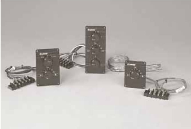
SA4A-ZB, SA3-ZB10 and SA4-ZB Models Shown