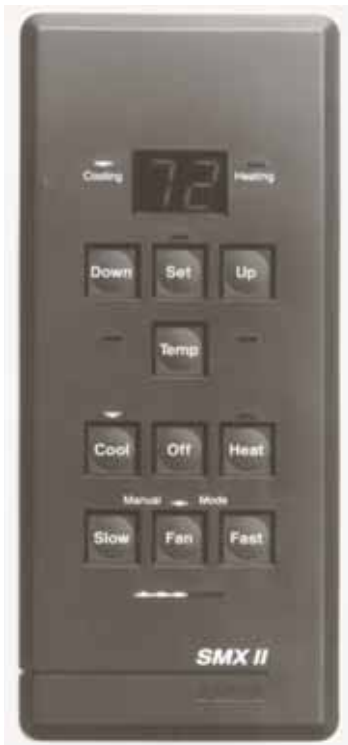
SMXIIAB Control and PXB Plate Shown